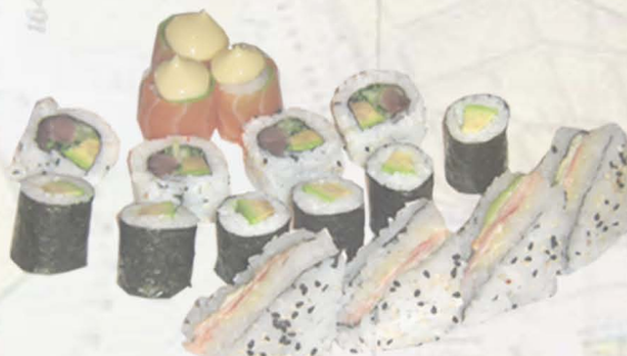
1ST MATES' PLATTER