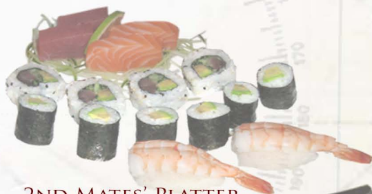
2ND MATES' PLATTER

2 SASHIMI SALMON & 2 TUNA | 2 PRAWN NIGIRI 6 AVO MAKI | 4 CALIFORNIA ROLL